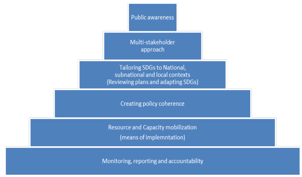
Figure 1: Stages for adaptation of SDGs into national context

Review mechanisms and processes at the national level will include internal review, external review, peer review, inputs and information from audit and oversight agencies, and evaluations of systems, policies and programs. Figure 1 below presents the summary of stages for adaptation of SDGs into national context.